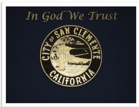
San Clemente, California